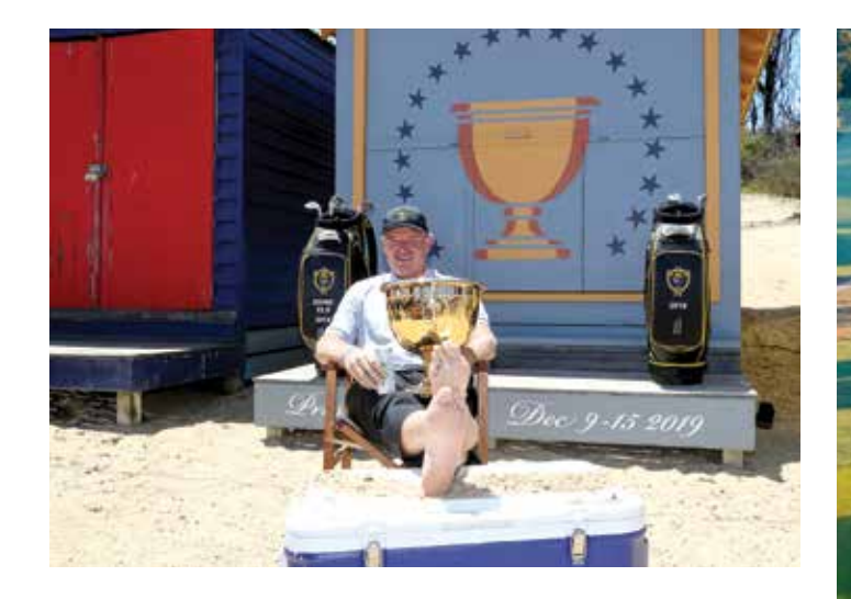
CLOCKWISE FROM TOP LEFT: Ernie Els chilling out at Brighton Beach with the President's Cup trophy; The strategic bunkering at Yarra Yarra Golf Club; Possibly the continent's most famous golf course and site of the President's Cup, Royal Melbourne Golf Club.