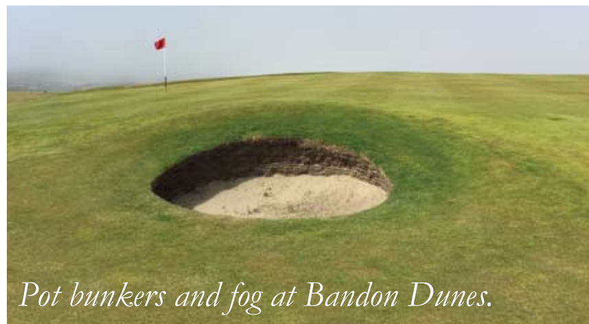
Pot bunkers and fog at Bandon Dunes.

• 57744 Round Lake Road • Bandon, OR 97411, USA Toll Free: 888.345.6008 • Local: 541.347.4380 www.bandondunesgolf.com