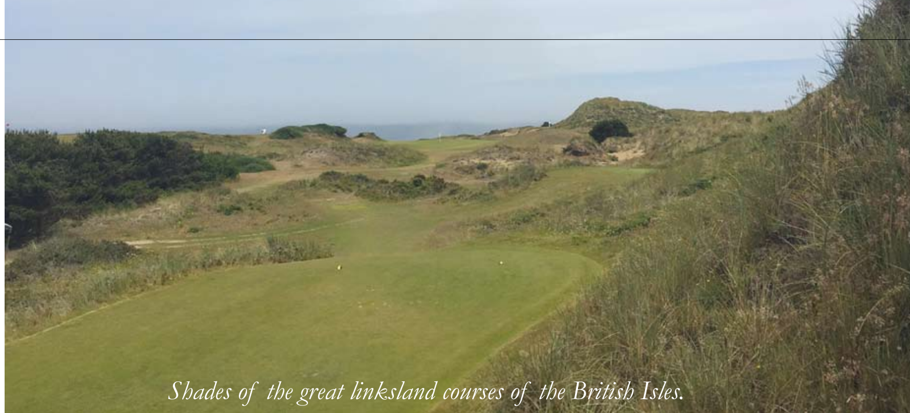
Shades of the great linksland courses of the British Isles.