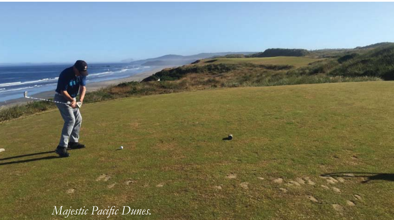
Majestic Pacific Dunes.

The finished product is not only a seamless addition to the resort's armoury of memorable and exciting links holes but a walking education in classic course architecture. You'll find a Road Hole at 'Old Mac', albeit a straightaway version compared to the dogleg 17th at the Old Course, but with a green complex, devilish pot bunker and swales a close match with the original.